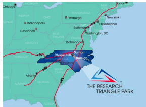
Figure 1. The Research Triangle Park is located within 600 miles of 50 percent of the nation's population.

The Research Triangle Park (RTP) was founded by a committee of government, university, and business leaders as a model for research, innovation, and economic development. By establishing a place where educators, researchers, and businesses come together as collaborative partners, the founders of the Park hoped to change the economic composition of the region and state, thereby increasing the opportunities for the citizens of North Carolina.